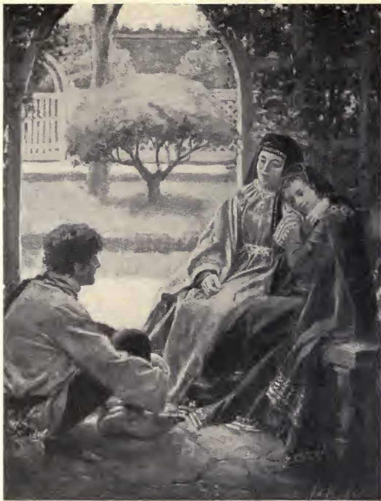
Myles entertains the Lady Anne and the Lady Alice with his adventures